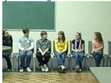
Grade 6 presenters answering audience questions.